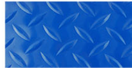
BLUE FR DIAMOND