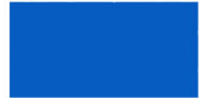
BLUE FR SMOOTH