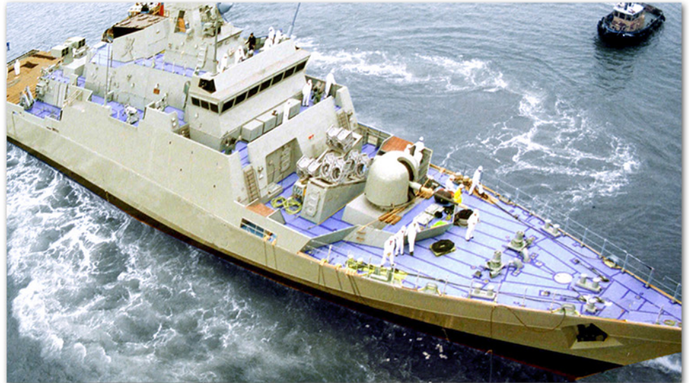
Diamond Plate Cover Guard